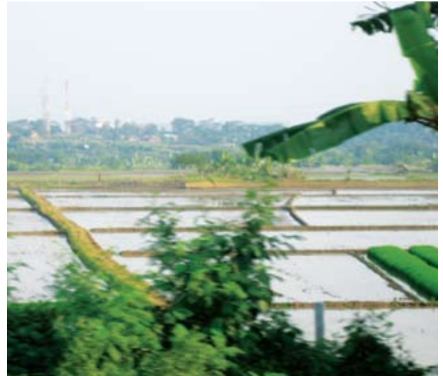
A WEST JAVA RICE PADDY

West Java is one of Indonesia's most important agricultural provinces, thanks to its favourable climate and fertile land. It is Indonesia's largest rice producer and is also famous for its tea plantations, which also double as a tourist attraction. Other important commodities include rubber (also processed locally), palm oil, sugar cane, cocoa, coffee and fruit/vegetables.